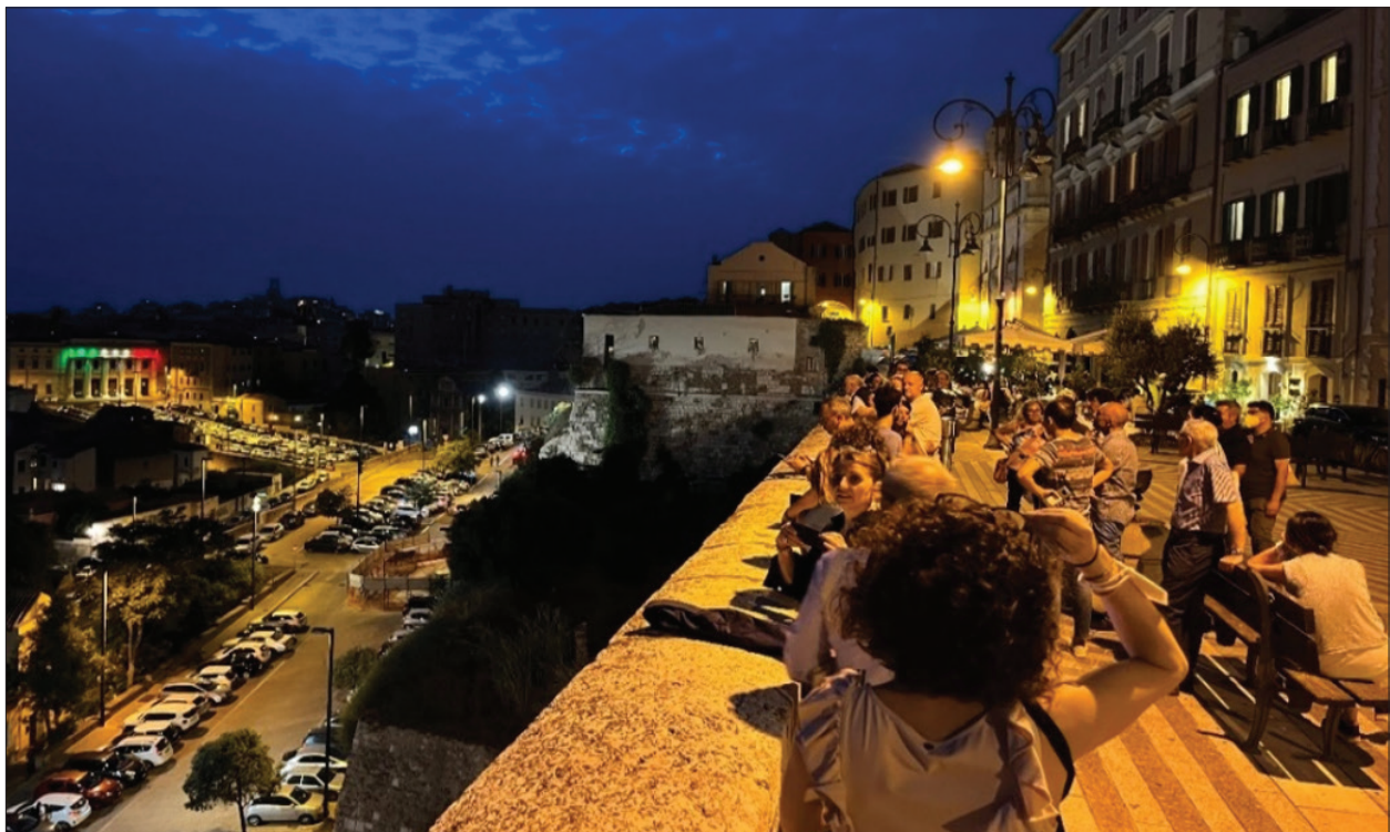
Conference attendees during the social event, 'Cagliari by night'

The next National Congress of Industrial and Environmental Hygiene will be held in June 2023 in Genoa (Liguria region, Italy), where we hope to reach the same levels of participation from the members, and to have more international attendees.