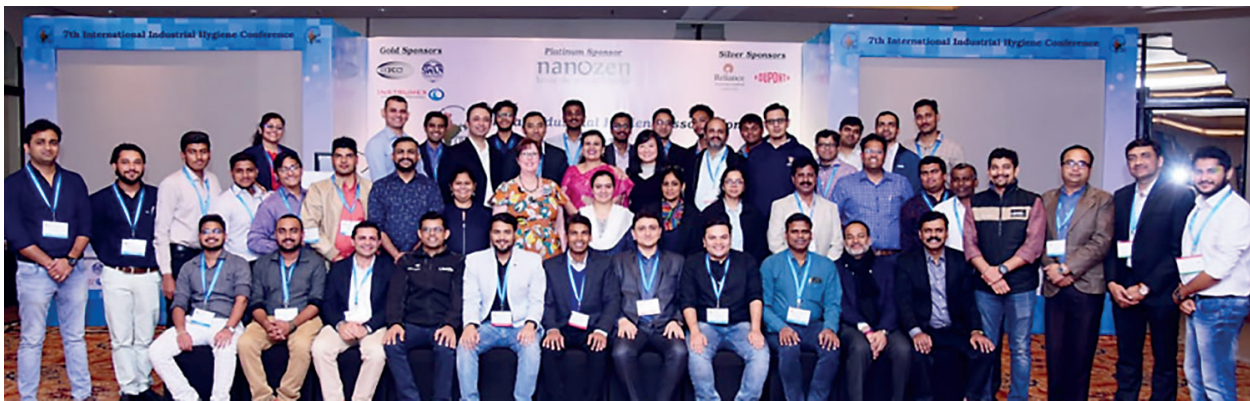
Participants in the 7th International Industrial Hygiene Association Conference and Professional Development Course of the Central Industrial Hygiene Association (CIHA) of India